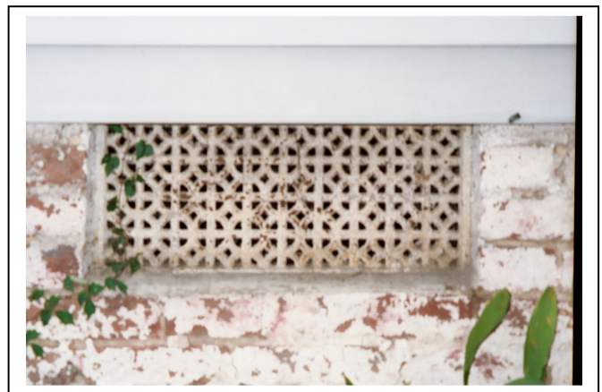
Decorative foundation elements such as these cast iron grilles should be preserved and maintained.