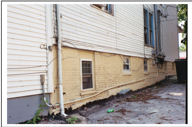
Foundation materials can help show the development of a structure over time.