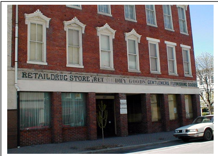
Historically, signs were often located in the storefront cornice area, as seen on this Pearl Street building.

Sg20 Painted, vinyl or gold leaf transom signs may be up to twenty percent of the transom glass area.