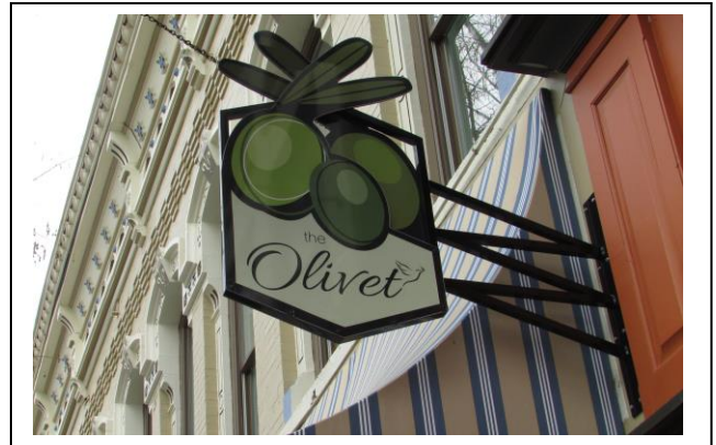
Clockwise from top left: ghost sign (appropriately restored), projecting sign, unified tenant / marquee sign, painted wall sign, window sign, flush-mounted wall sign.